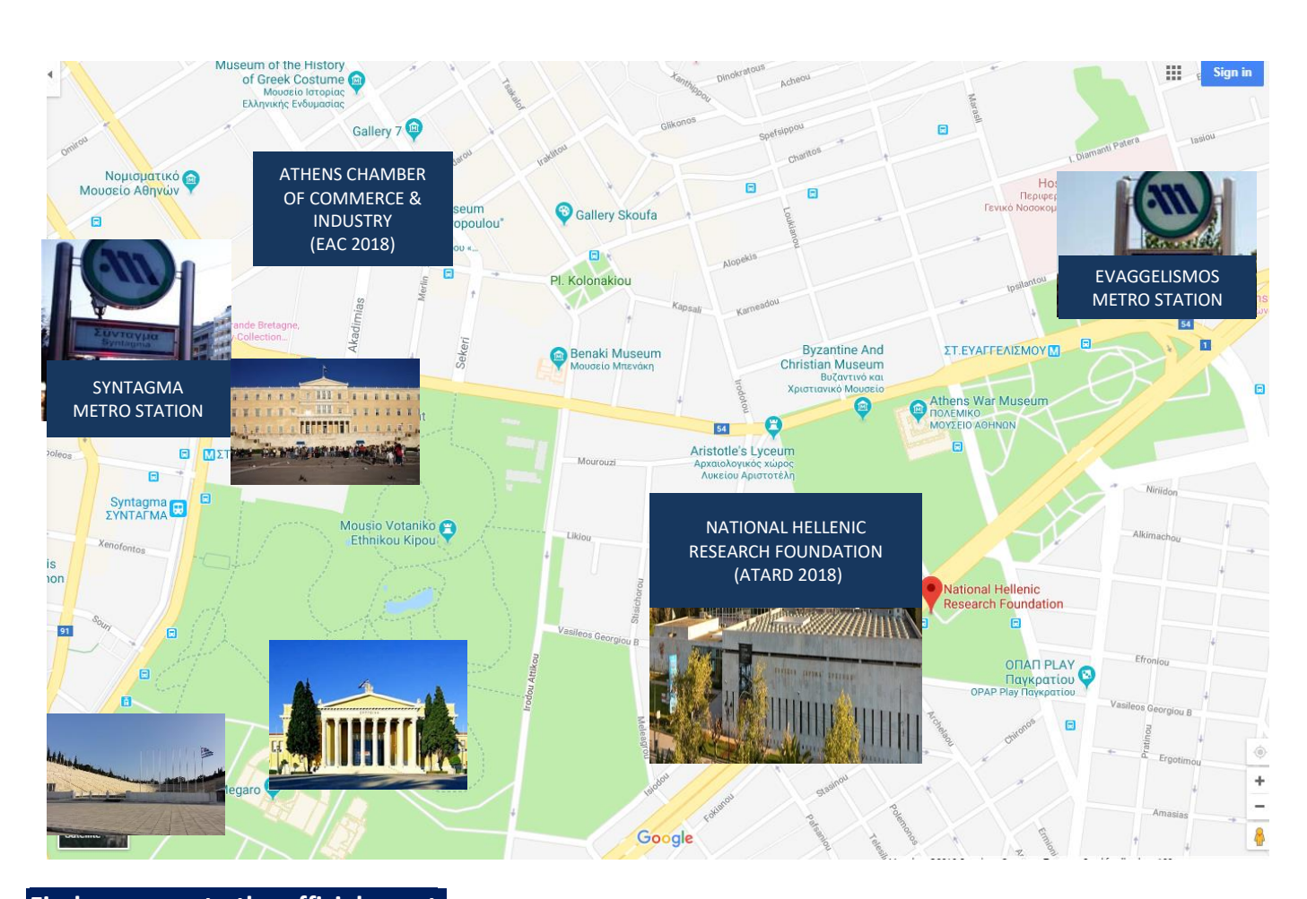
Find your way to the official event